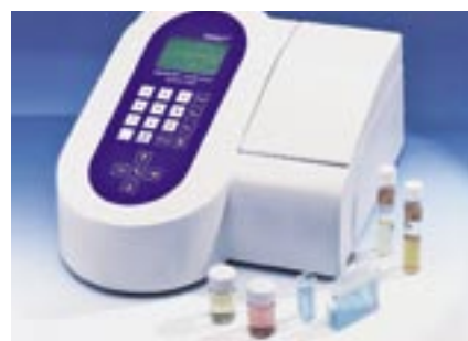
Picture ..... AQUANAL®-professional SPECTRO 1000 Photometer

SPECTRO 1000 is a modern single-beam spectrophotometer with an excellent price/performance ratio that was specially designed for water testing. It is ideal for use in water and waste water analysis and can also be used with a wide range of other applications. The unit is equipped with a wide spectrum of pre-programmed methods based on the proven range of tablet reagents and liquid reagents. Besides all AQUANAL®-professional Tests, routine analysis made in rectangular cuvettes (from 1 cm to 5 cm) or in tubes (16 mm or 24 mm diameter) can be performed using the SPECTRO 1000. All results can be exported to your PC.