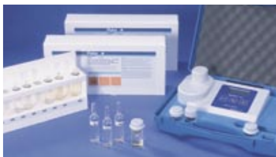
Table ..... AQUANAL®-plus SPECTRO Hazen Photometer Product List

Close-up of AQUANAL®-plus SPECTRO Hazen Photometer