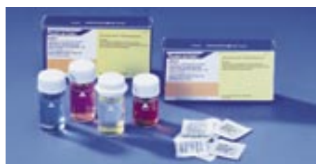
Picture ..... AQUANAL®-professional Liquid Reagents

Reagents in tablet form have none of the limitations of the liquid reagents described above. Each tablet contains a precise amount of the required substances (indicator, buffer, complexing agent, etc.). Tablets are spill-proof and provide a convenient way to eliminate the risk of incorrect dosage from the start. Most of the AQUANAL®-professional reagents are provided in tablet form.