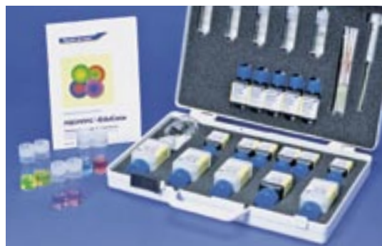
Picture ..... AQUANAL®-plus Educase

make consumer decisions (are there differences between brands of bottled water?) or show effects of environmental conditions (does increased rainfall increase or decrease hardness of river water?). Many such experiments can be designed to teach important aspects both environmental and analytical chemistry. The case comes complete with the entire equipment required for the determinations. Titrations are carried out on a micro scale (5 mL-10 mL test solution) so that both the amounts of reagents consumed and the volume of waste produced are kept small.