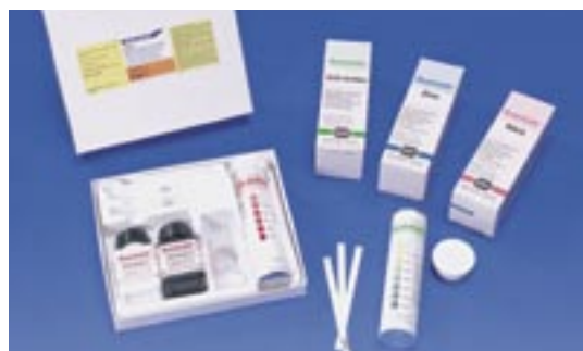
Picture ..... QUANTOFIX®-Test Sticks and Kits

A number of determinations require the use of additional reagents which are enclosed with the test sticks in a single kit. Instructions for use are enclosed as well. Each pack allows 100 tests.