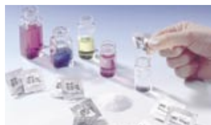
Picture ..... AQUANAL®-professional Vario H Reagents