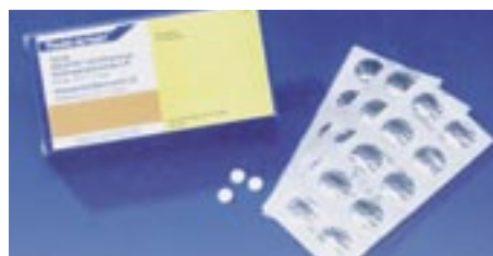
Picture ..... AQUANAL®-professional Tablet Reagents