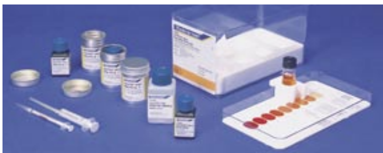
Picture ..... AQUANAL®-plus test kits, refill packs and check solutions

The AQUANAL®-plus product line consists of nearly forty test kits with the corresponding refill packs and check solutions for on-the-spot or laboratory water analysis. They provide fast results under safe and clean operating conditions. The results can be obtained using the color chart included in the test kit, or the AQUANAL®-plus SPECTRO 2 or AQUANAL®-SPECTRO 3 Photometers. AQUANAL®-plus Vario Case allows you to combine four or five different test kits into one case.